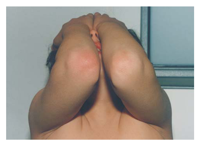
Figure 1.—Macroscopic appearance of the fixed eruption in the skin of the right elbow.